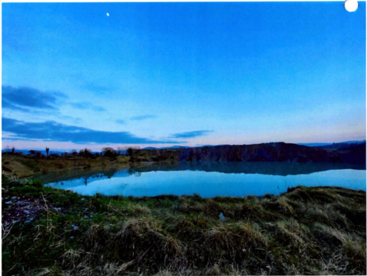
Silt pond is the highest here I've ever seen in it in the last thirty years.