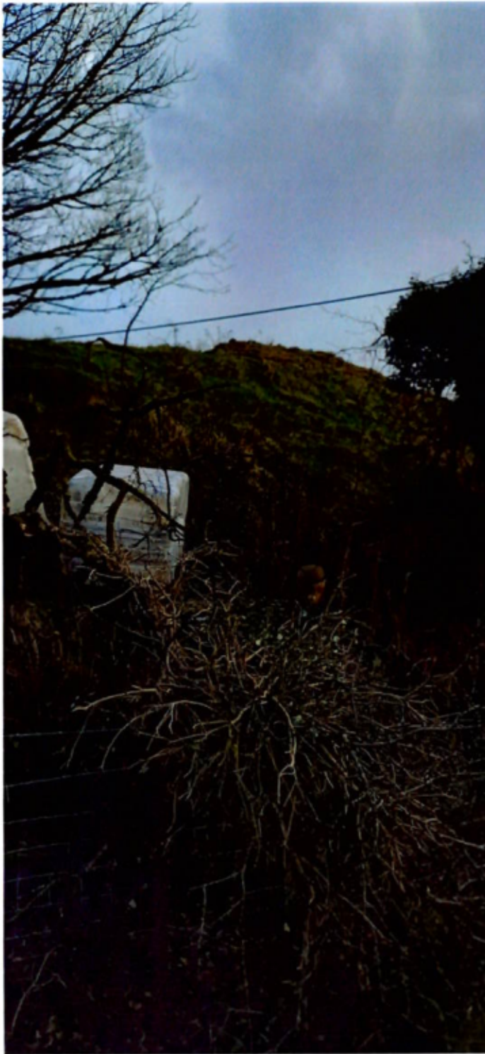
Low lying cables can be seen here touching the top of the bank these can be easily accessed via the unlocked wooden gate at the entrance to the silt pond.