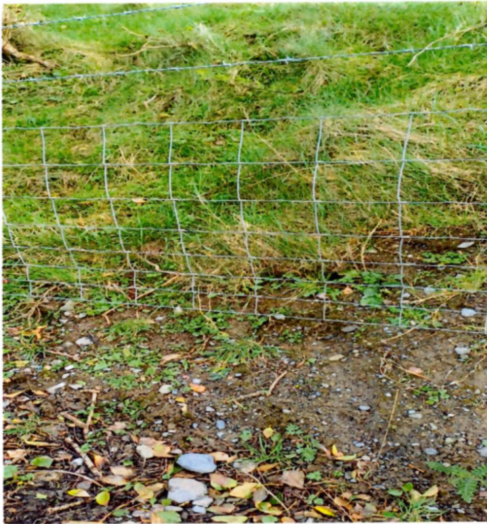
Huge gaps in the fencing at ground level to let livestock or children through.