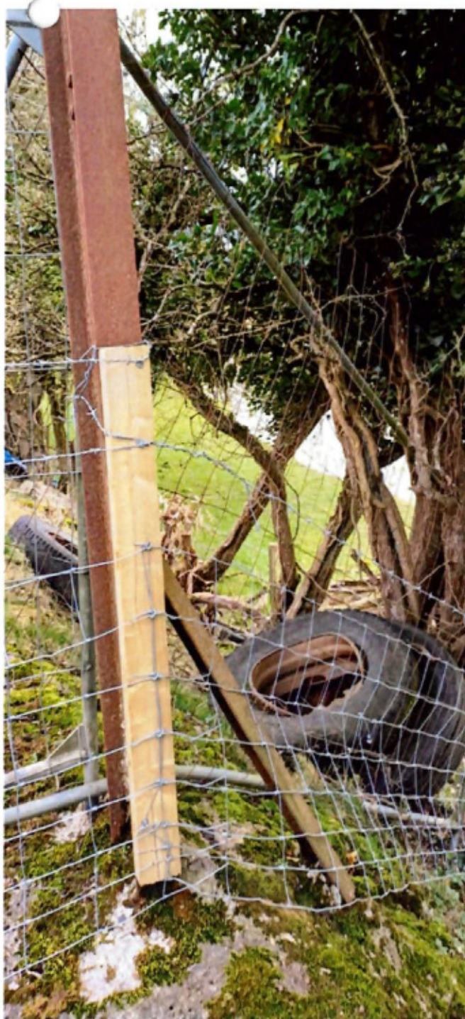
Access can be gained from under the fence and by climbing up the side.